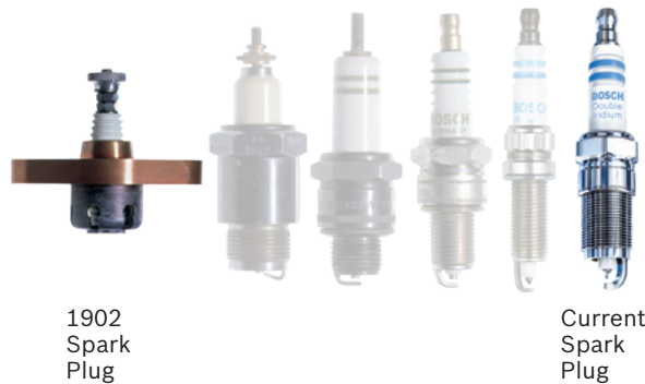
1902 Spark Plug

Production takes place in the most sophisticated manufacturing facilities in the world, where Bosch quality control standards assure that every plug bearing the Bosch name earns it.