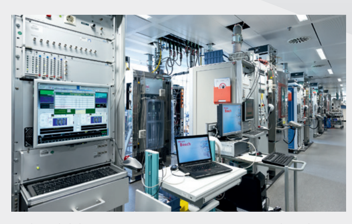
High-tech laboratory continuous-operation test benches

ESI6 brake fluid has been subject to intense testing of both system pressure build-up and wear and noise at extreme temperatures.